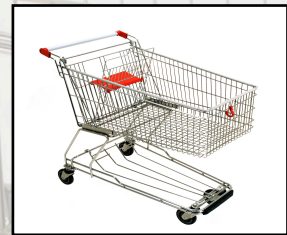
SB 150 L