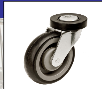
Standard wheel 125mm

The standard wheels have a rubber tread and are fitted with precision ball-bearings so that they have a low rolling resistance. Available as fixed wheels and as caster wheels with sealed upper bearings. Soft plastic protective rings on the wheels and on the upper bearings protect the wheels against abrasion, dust and damage. A number of shopping trolley models have coloured plastic hubcaps as additional protection. The wheels are available in sizes of 100 mm or 125 mm