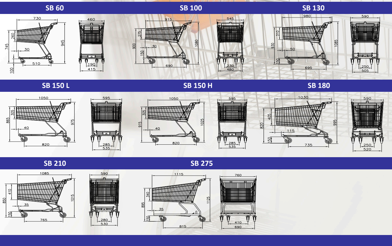
Trolley length in mm