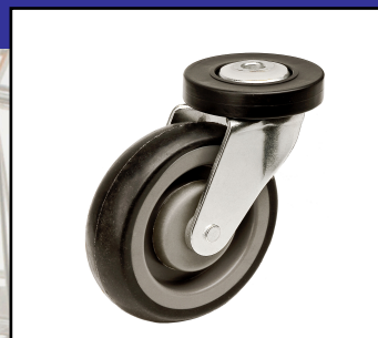
standard wheel 125mm

Help your customers to have an enjoyable shopping experience with smooth-rolling, accurately steering shopping trolleys. Such as the shopping trolleys from DCR Europe. Our trolleys have top-quality wheels and always go where you want them to go. The standard wheels have a rubber tread and are fitted with precision ball-bearings so that they have a low rolling resistance. Available as fixed wheels and as caster wheels with sealed upper bearings. Soft plastic protective rings on the wheels and on the upper bearings protect the wheels against abrasion, dust and damage. A number of shopping trolley models have coloured plastic hubcaps as additional protection. The wheels are available in sizes of 100 mm or 125 mm